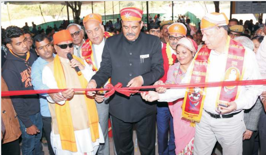
Organizational Visit by Union Minister for State

The Union Minister of State for Social Justice & Empowerment, Mr. Sapla has said that the 'almighty' gets pleased with the service of 'wretched & distressed' people. He was addressing the gathering while inaugurating the camp that was organised on behalf of 'Narayan Seva Sansthan' at its Sewamahateerth premises in Badi in Udaipur on 25th November, 2017 for corrective surgeries of 501