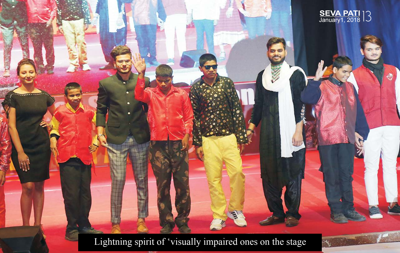
Lightning spirit of 'visually impaired ones on the stage