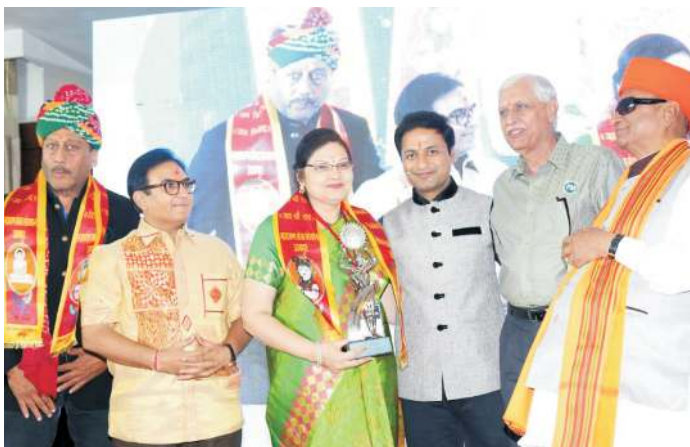
Felicitating the service contributors of the organization