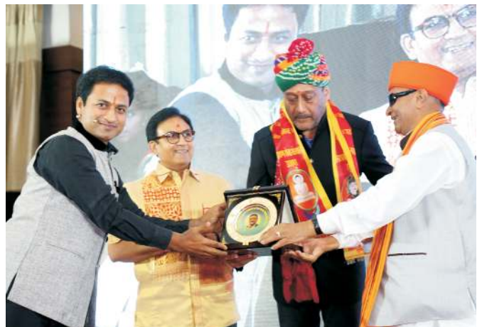
Presenting a memento to Mr. Jackie Shroff