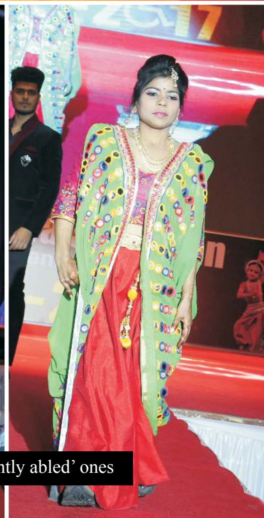
Let us come and witness the strength of 'differently abled' ones